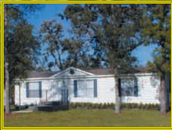
WOODED HOME SITES