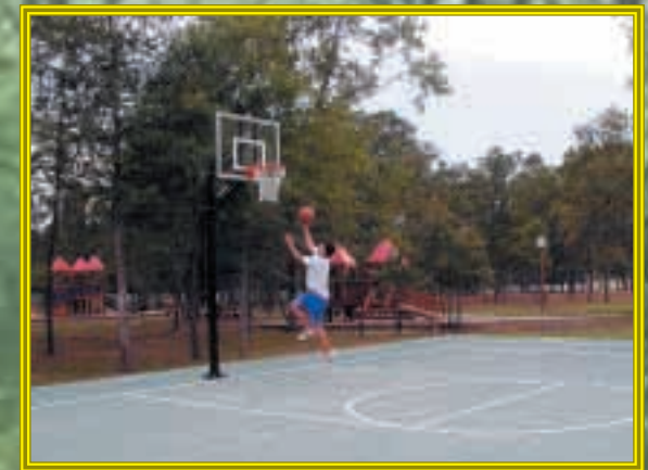
BASKET BALL FULL SIZE COURT

GRAND OAKS is located on 265 acres, all wooded home sites are in a country setting.