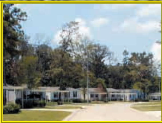
TYPICAL STREET VIEW