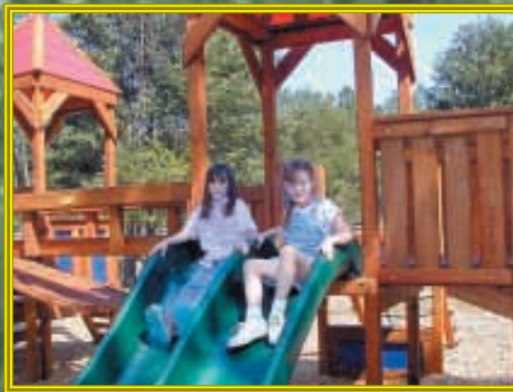
PLAY PARK ON-SITE