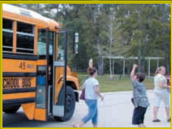
MAGNOLIA I.S.D. SCHOOLS