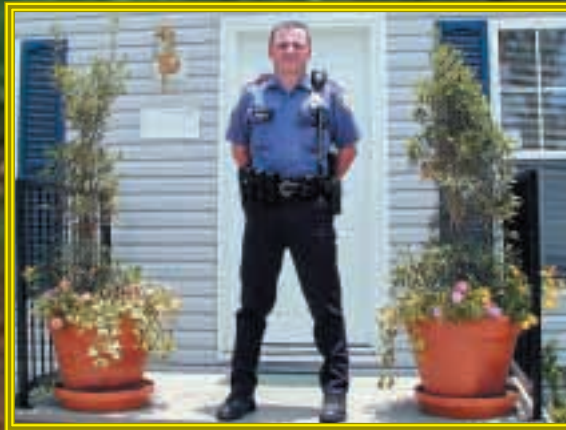
RESIDENT OF GRAND OAKS